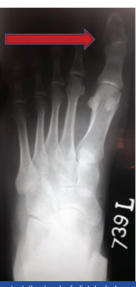
[Table/Fig-1]: Left great toe showing enlargement at the level of distal phalanx. [Table/Fig-2]: X-Ray film showing radiolucent lesion with lytic area (red arrow marked)